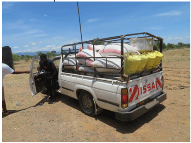
Maize, beans, cooking oil and salt.