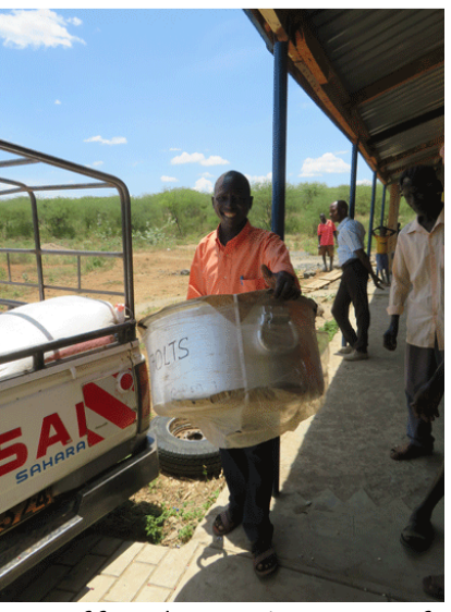
We offered a cooking pot of 75 L in a