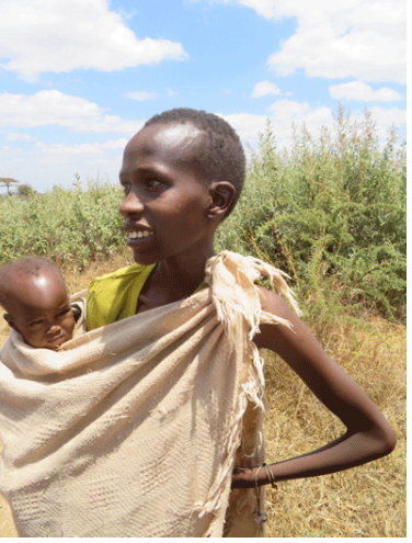
Maasai woman, at Ishinon village. Mother of twins, she is in danger of dying