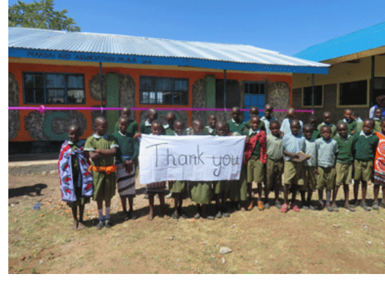
The 2 new classrooms built by MAA at Iloopilukuni, Transmara