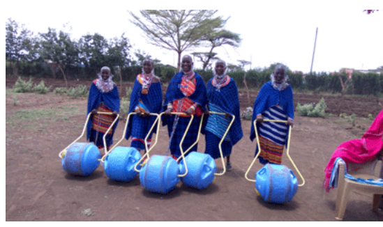
In Rombo area.