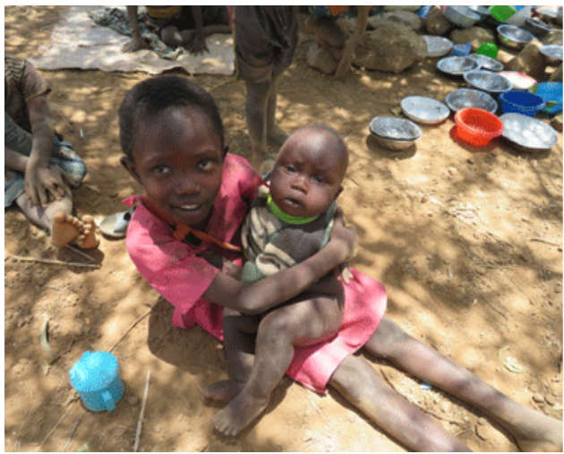
Answer: so that the baby could get food, as the pupil, once per day! Kashokon primary.