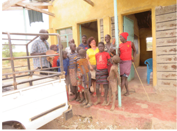
the second school: Kashokon primary