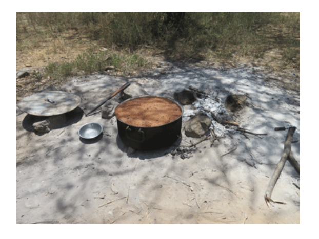
A school cooking place: the big pot full of food.