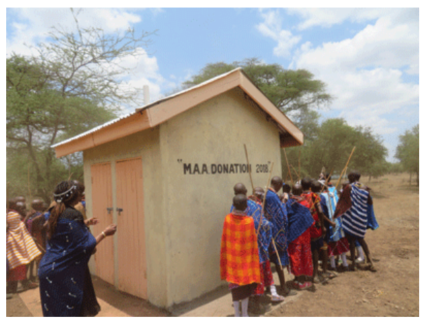
With 4 new latrines.

School boys dressed like Maasai warriors are dancing around!