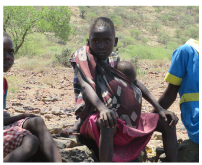
Why a Pokot pupil of 8-9 years old, goes to school with her baby sibling?

I know they will shock more than one. They speak for themselves: