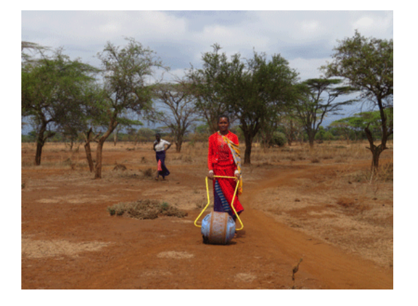
So now, when you walk in the bush, you may come across women fetching water in this way!