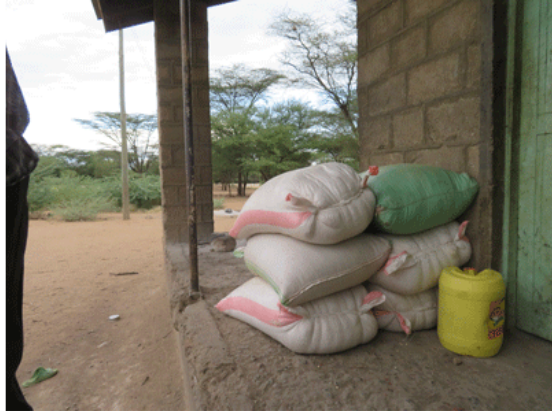
Last school (4th) delivered, in Chemolingot, where more than 150 refugee children, homeless and without parents live into the school facilities.