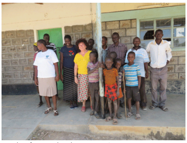
In the first school: Lemuyek primary