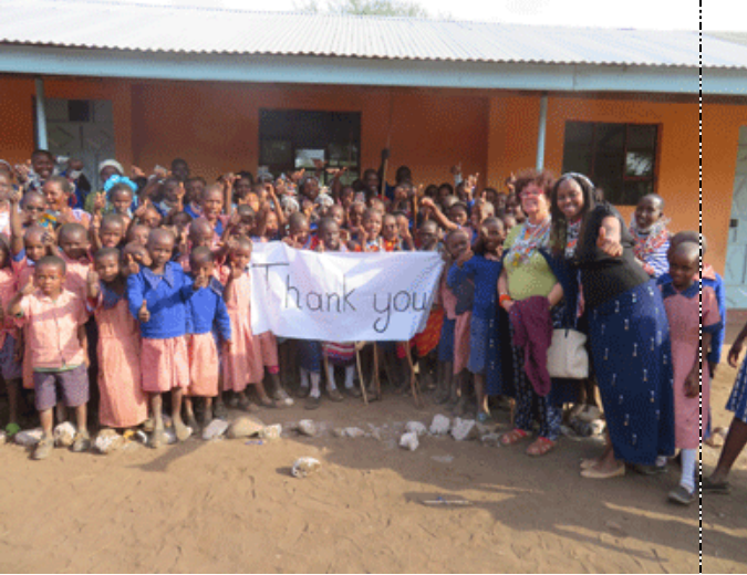
2 new classrooms built by MAA at Orgumaek, village, Loitokitok district, south Kenya.