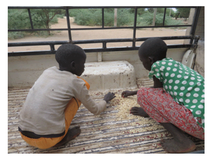
Once the vehicle is empty, two girls pick up the last cereal grains by hand. Not a grain should be wasted!