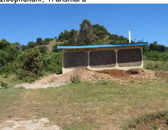
The 6 new latrines, necessary after increasing the number of school classes.