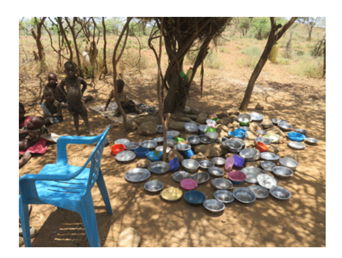
Every child comes in school with its plate. At noon, a portion of boiled cereals will be distributed, often the only meal of the day...